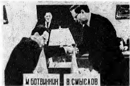
22. 1958: the return match